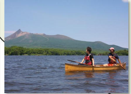
Nature and activity